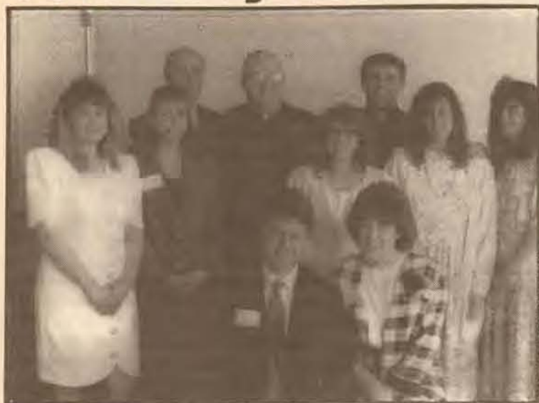
Bryant students after confirmation ceremonies last Sunday