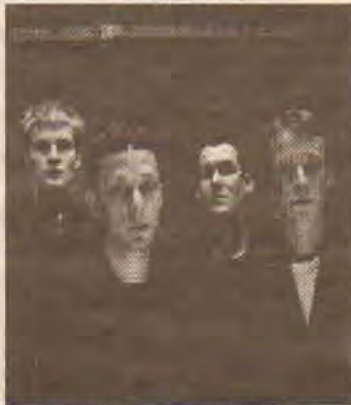
British Sea Power are Yan, Hamilton, Noble, and Wood.

With singles such as "The Lonely", "The Spirit of St Louis", and "Childhood