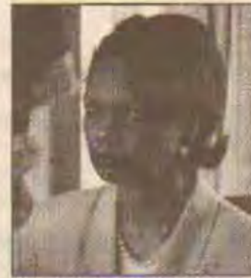
Rice faces criticism for refusing to testify publicly before the commission

have an answer to the scurrilous allegations that somehow the president of the United States was not attentive to the terrorism