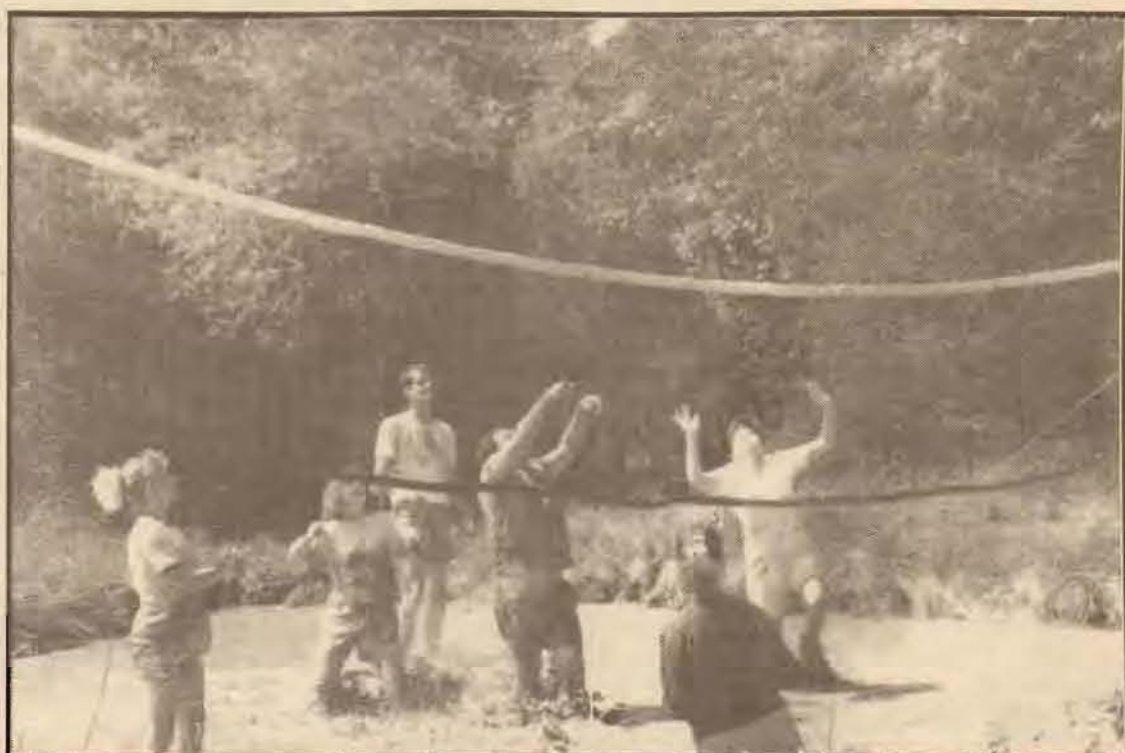
Participants anchor themselves in the mud during 1990's tournament.