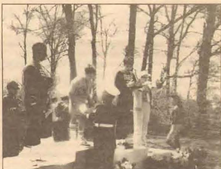
Last year's Special Olympians receive their medals.