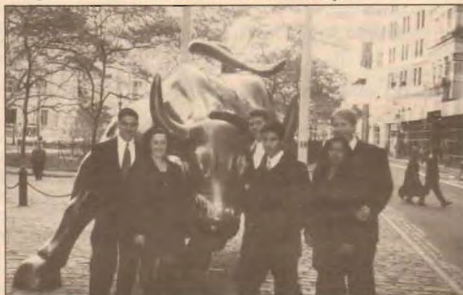
Students touring New York in front of The Bull