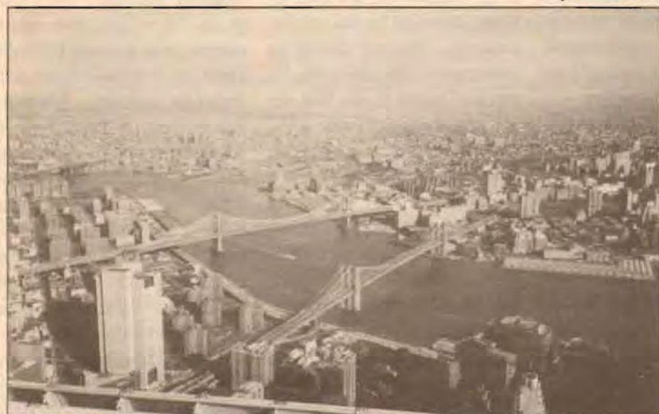
View from the top of the World Trade Center