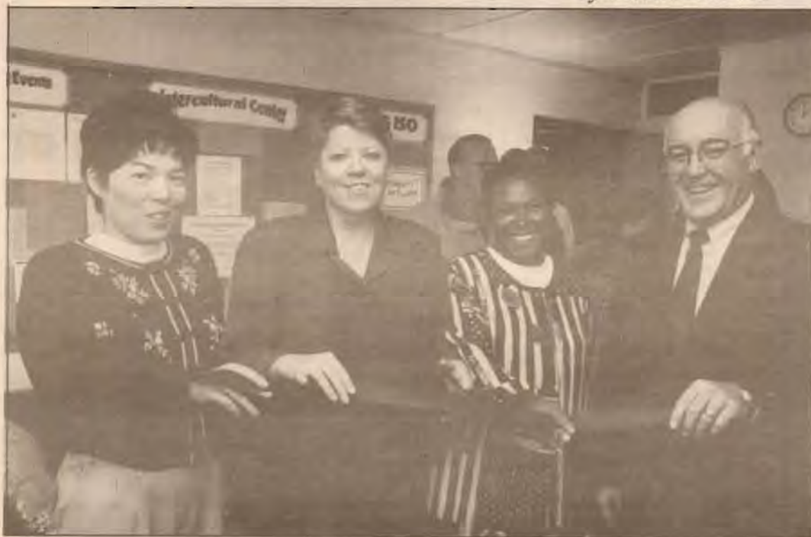
College Gathers for Opening of ICC