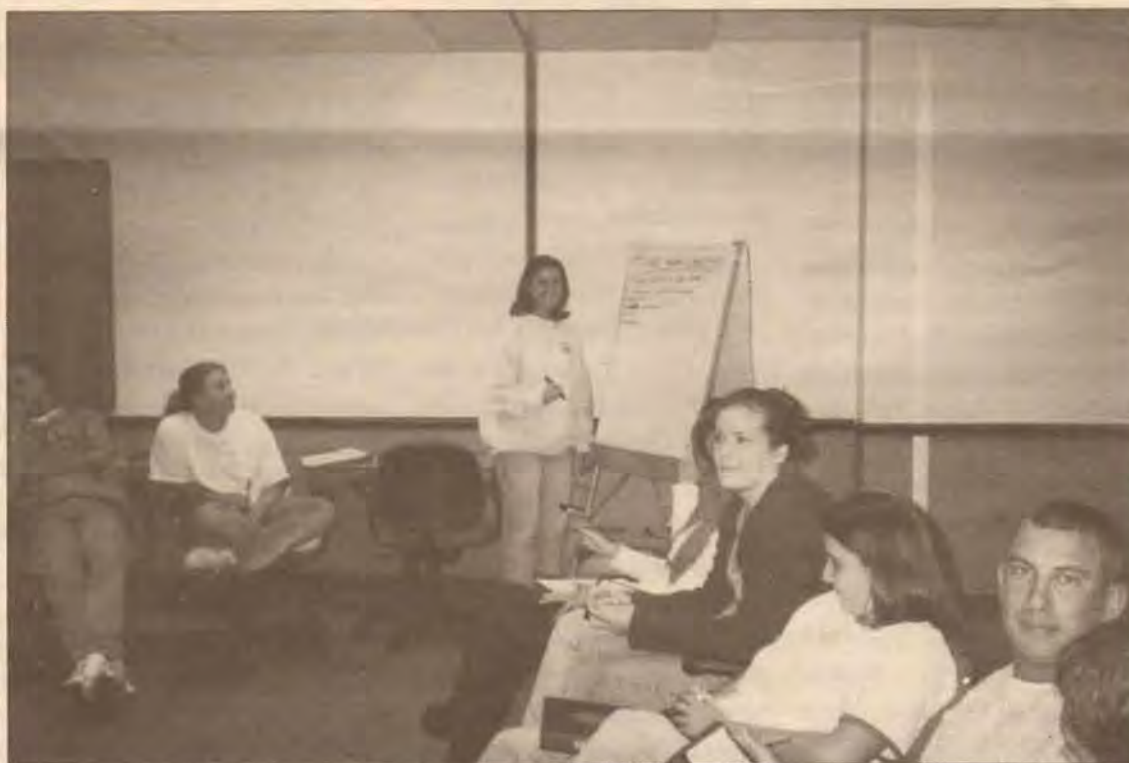
ABOVE: Senators Set their Goals at Retreat