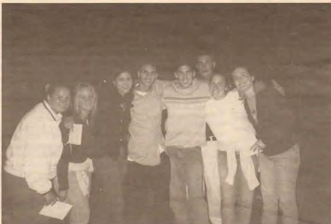
ABOVE: Senators having a blast at the Carnival

That's about it for now. We are always looking for help, so if you are interested in joining any one of our committees, or you would like to help out on a limited basis, contact the senate at senate@bryant.edu .