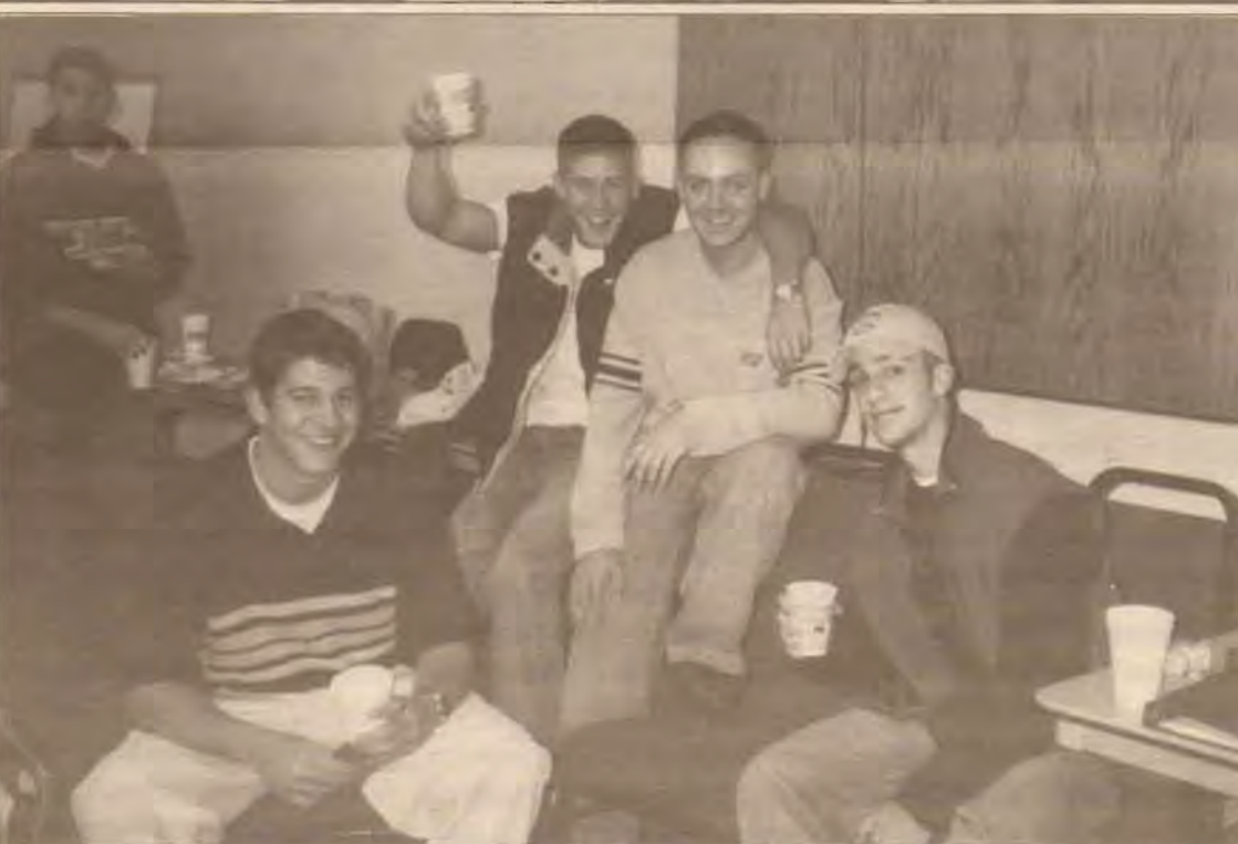
ABOVE: GQ Senators Having Breakfast at Senate Retreat BELOW: Senators at Wrights