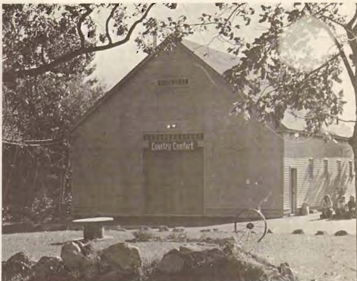
COUNTRY COMFORT will be bringing many good times to Bryant College again this year. We provide a different kind of atmosphere to the students here. Come on down for a visit! If you want it, we have it!

Pledging is that hectic time of the year when freshmen and