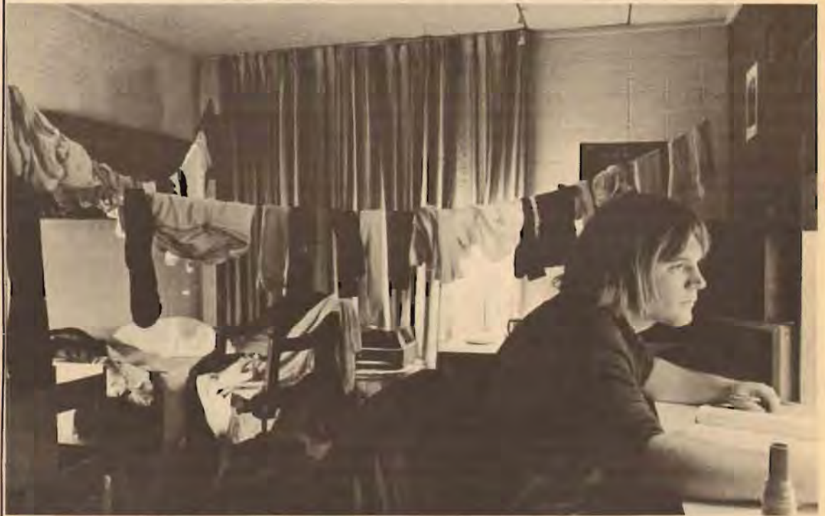
What do you do with your damp underwear and socks after two dries?