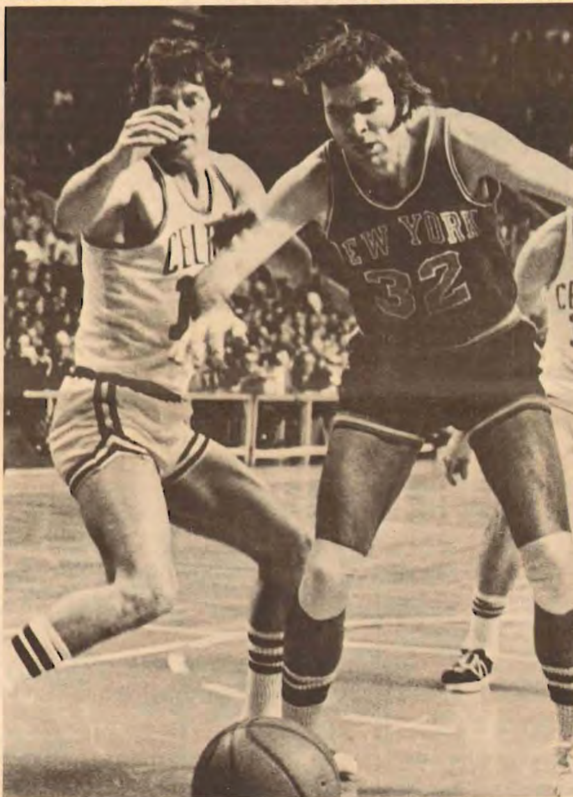
New York Knicks' Jerry Lucas (32) knocks down rebound while battling for ball with Celtics' John Havlicek (L) during 1st quarter action at Boston Garden.

A tape recorder was used during the interview and the questions and answers are basically a word-for-word repeat.