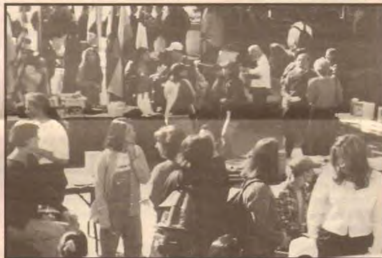
Students enjoyed food from different cultures on Unity Day.

All and all the concert was great; it made several people's weekend. People will be talking about the show for a long time. The show will impact many people for the weeks to come. Hopefully the next show sponsored by SPB will be just as great and even more students will come. Well, that's just another Saturday night here at Bryant. Hope you were there.