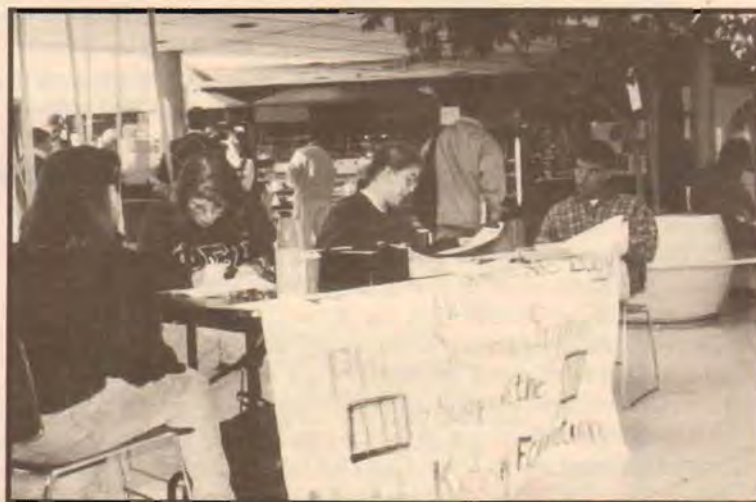
Phi Sigma Sigma held it's annual Jail-n-Bail Wednesday to benefit the National Kidney Foundation.

The Archway is composed weekly during the academic year by the undergraduate students of Bryant College. The publisher is Bryant College. This newspaper is written and edited by a student staff. No form of censorship is exerted over the content or style of any issue. Opinions expressed in this publication are those of the students and do not necessarily reflect the views of the faculty or administration of Bryant College. The Archway is printed at TCI Press in Seekonk, MA.