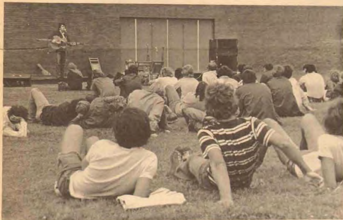
Freshman are entertained on the lawn by a local folk singer.