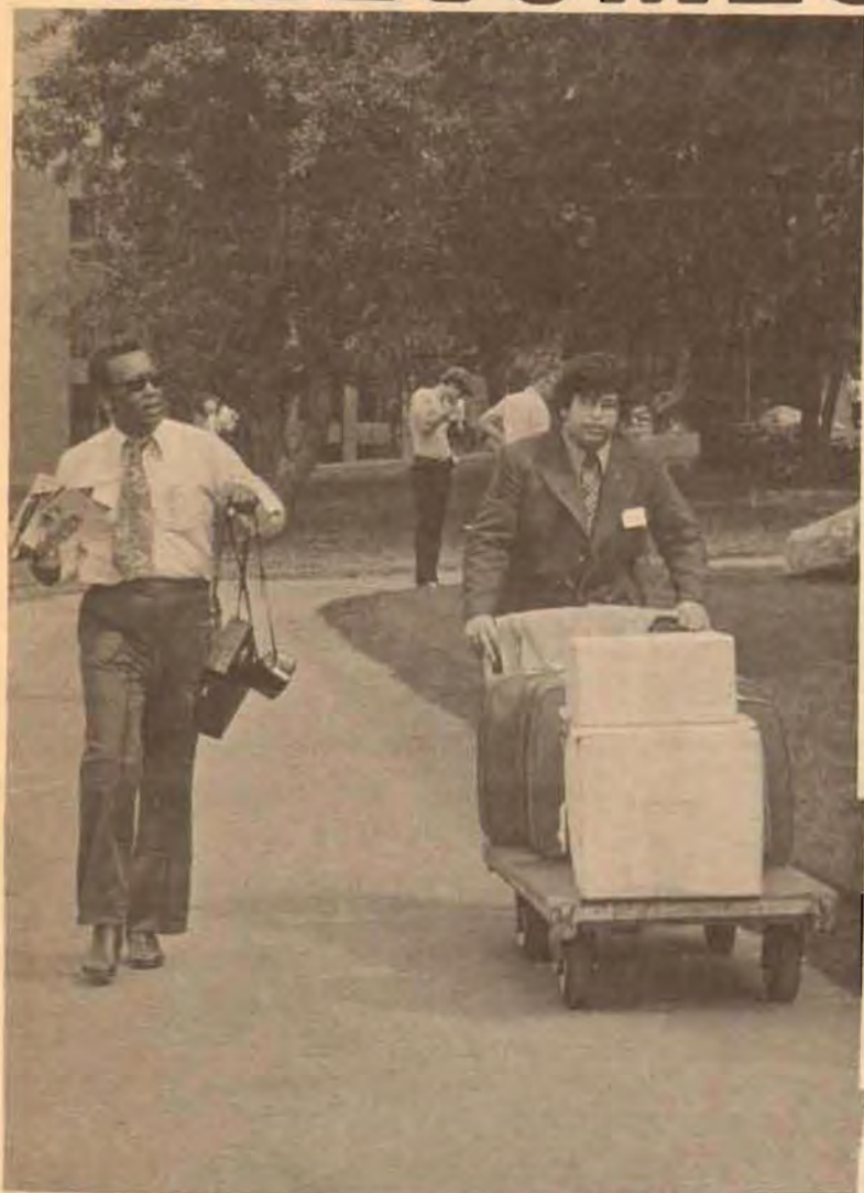
Rich pitches in to help move new student into dorm.