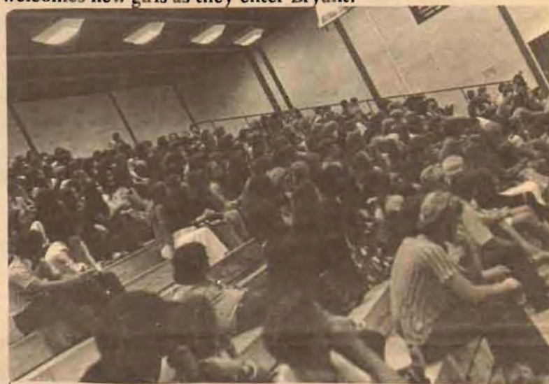
Freshman and transfer students listen to our fearless leaders.