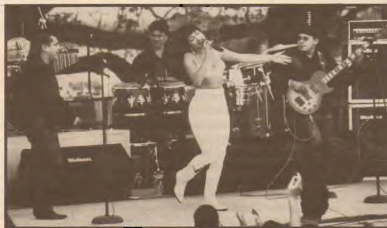
Jennifer Lopez stars in Selena as the Tejano singing sensation.

For more chances to win videos, movie tickets, free movie rentals, posters, and concert tickets to the Strand and Lupo's, check out my radio show on 88.7 WJMF