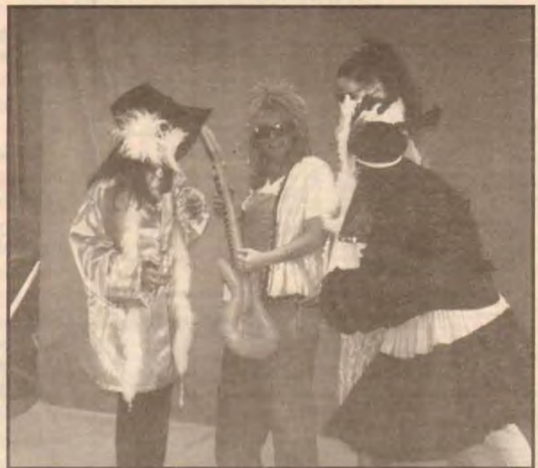
Above: Students enjoyed making videos at Starstruck video this past Friday, February 21.