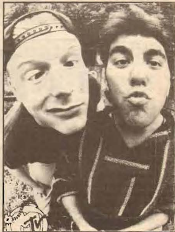
Red Johnny and The Round Guy

The Student Programming Board and Athletics would like to encourage all students and faculty to attend these events and enjoy Homecoming 1994!