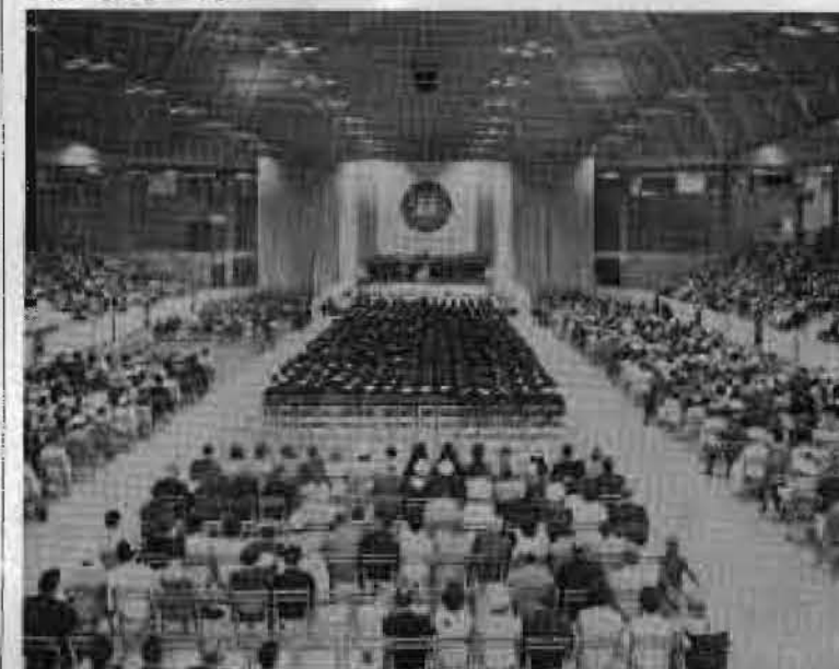
The new look of graduation. Bryant College graduation exercises today are more modern and elaborate. Shown here is the graduating class of 1962. Graduation is now held in the beautiful Meehan Auditorium on Hope Street. This modern auditorium comfortably accommodates the large number of graduates and their guests. Besides the formal ceremony at this beautiful building, the seniors have a well-planned Class Day, and a formal ball as part of their activities during graduation.