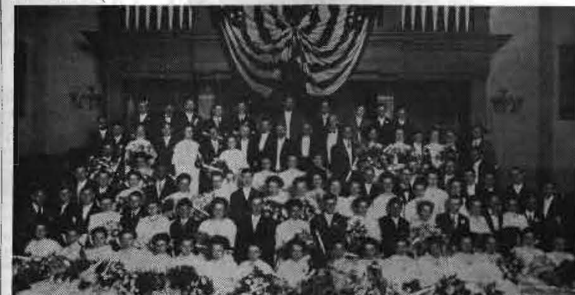
The Bryant graduating class of 1908 had only eighty-six graduates. The small number of graduating students pictured here is typical of the earlier classes. Behind the graduates stand the faculty of the school. The formal ceremonies were held at the Methodist Episcopal Church, Mathewson Street, Providence.