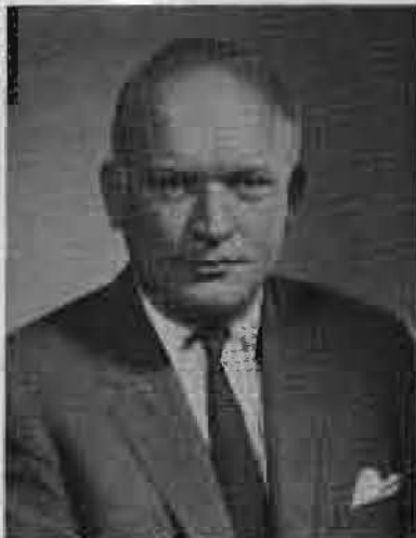
James Britt Donovan International Attorney-At-Law, Liberator of Cuban Prisoners

Doctor of Humane Letters (L.H.D.), Honoris Causa