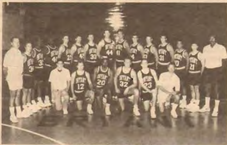
Bryant's 1988-89 Men's Basketball Team