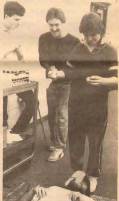
Student egged in the MAC