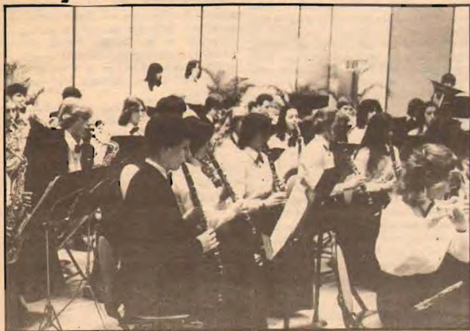
The Ponagansett Wind Ensemble will be at Bryant as part of the Bryant Performing Arts series, on April 25th.