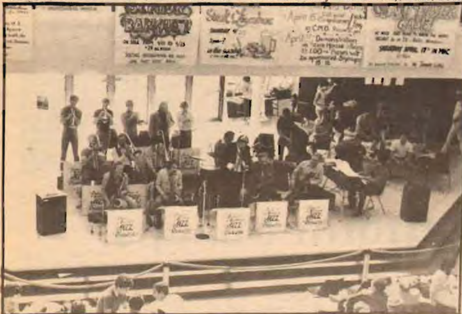
All that jazz