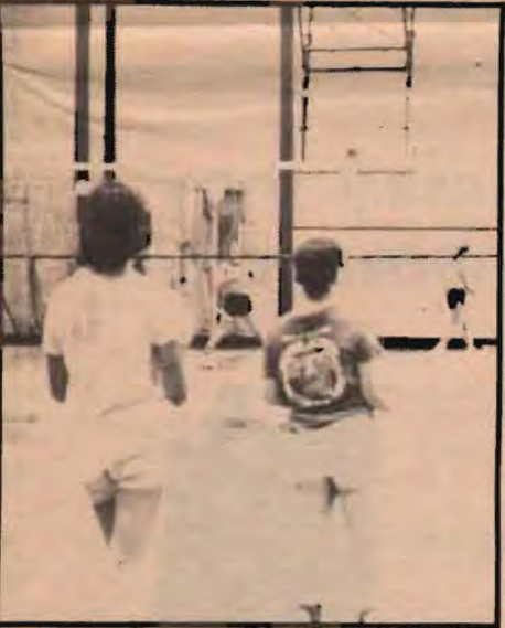
excited about the challenges they will face this year. The team has moved up from Division 3 to Division 2 which will sharpen the competition for the girls. Only one graduate left the team in the Spring, leaving five starters from last season plus two new