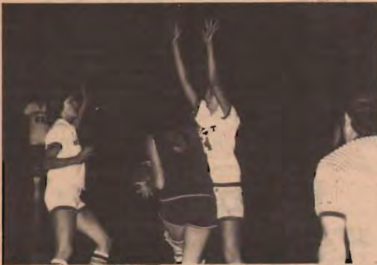
Women's Basketball in action