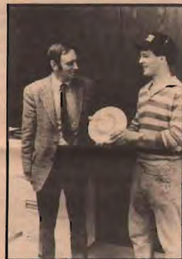
President receives frisbee