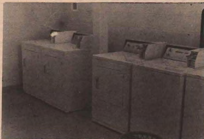
More Washers and Dryers