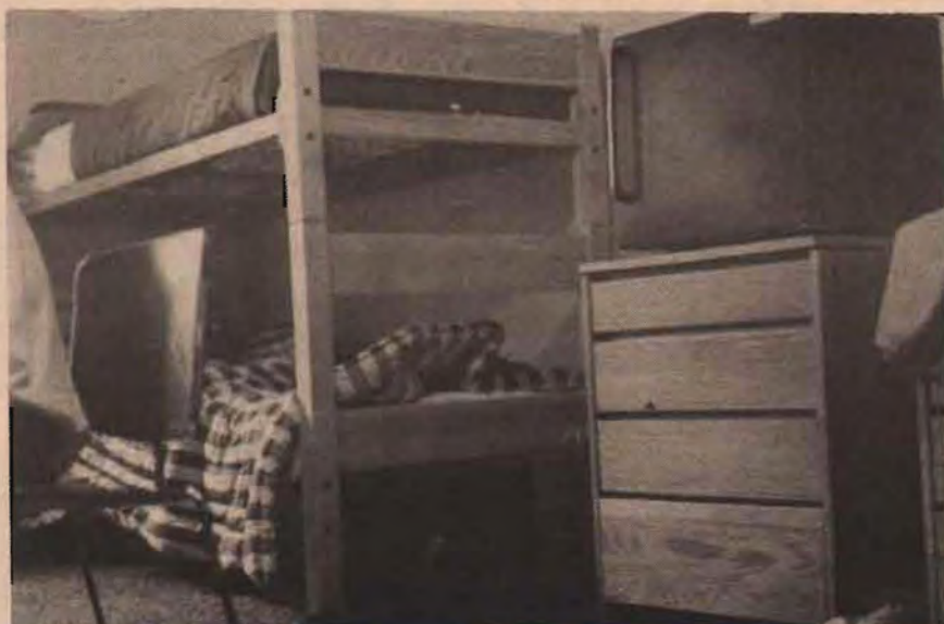
Less Drawer Space