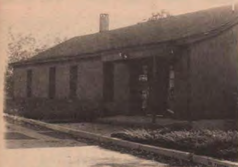
The Counseling Center