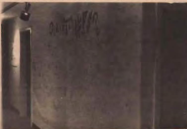
The Graffiti Wall

with any student who feels a need to talk to someone.