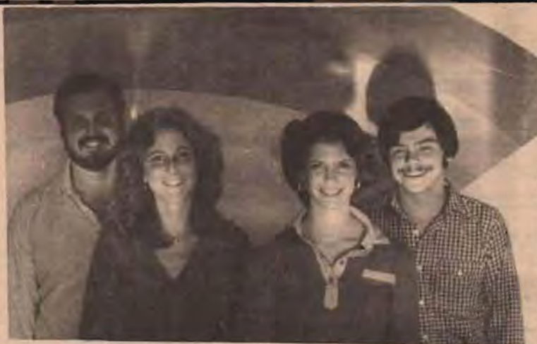
The Student Assistant Staff