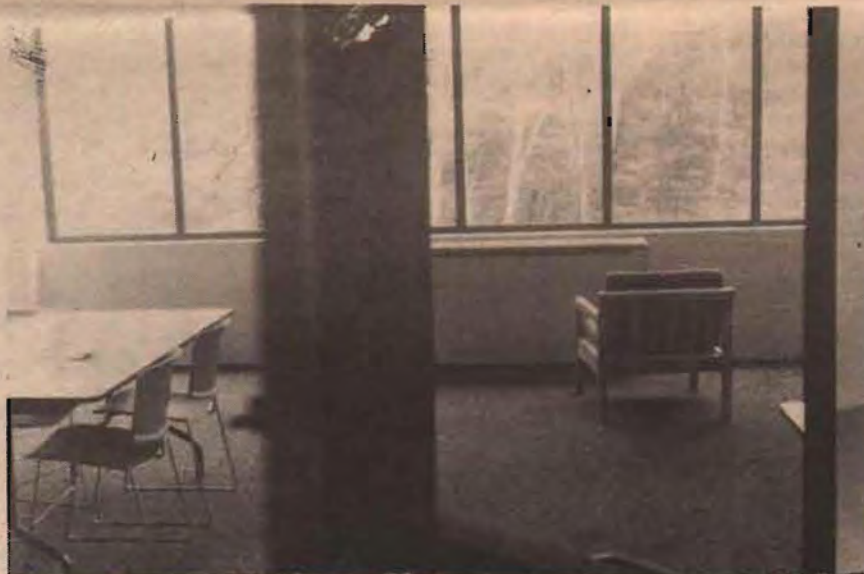
Less Use (Empty lounge)