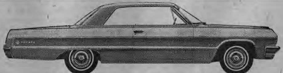
'64 Jet-smooth Chevrolet Impala Sport Coupe (119-in. wheelbase)