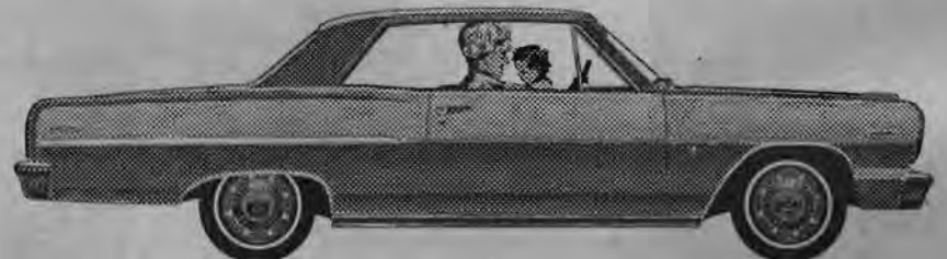
New Chevelle Malibu Sport Coupe (115-in. wheelbase)