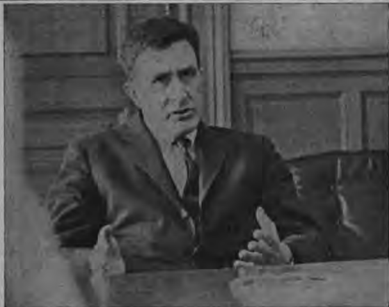
Governor Chaffee answers a question directed to him by a member of the Current Events Club, who visited him at the state house.