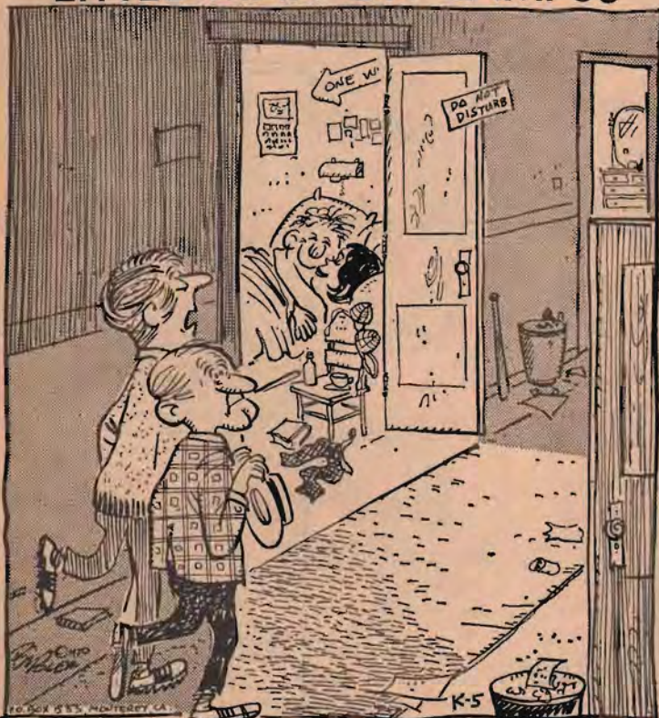
"YOU WILL PROBABLY NOTICE, DAD—SINCE YOU LIVED IN TH' BOYS DORM TH' RULES HAVE BEEN RELAXED SOMEWHAT TO REFLECT A MORE PERMISSIVE ATTITUDE ON TH' PART OF TH' ADMINISTRATION."