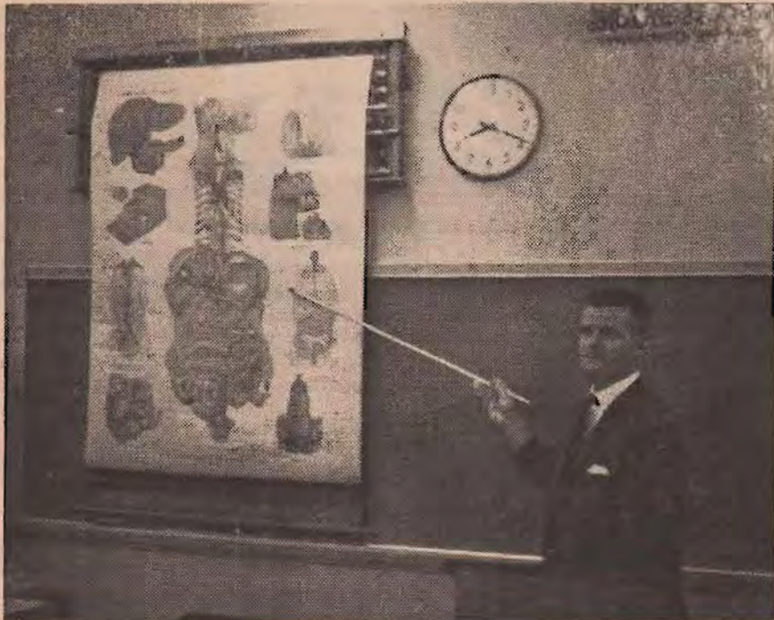
"That sandtrap on the 15th hole was a real sweetty... I remember how I played that nine-iron with all the skill of..."