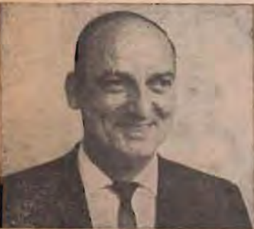
Whoop, whoop, whoop.

One day while laying on the green A little book I seen. An English grammar was the edition So I left it lay in the same position.