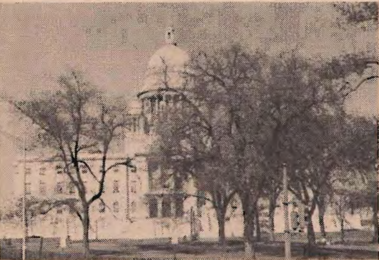
The first building to be completed at the new, modern Bryant Campus . . . the outhouse for the administration building.