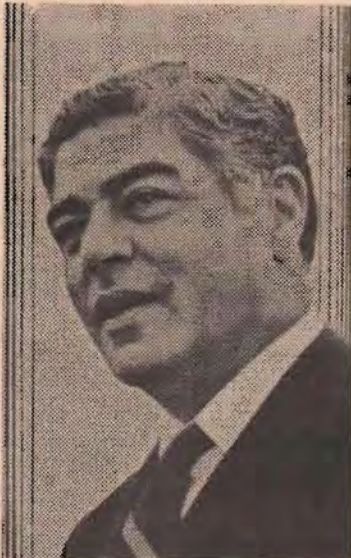
"...and if elected governor, I promise that Rhode Island will NOT have an income tax."