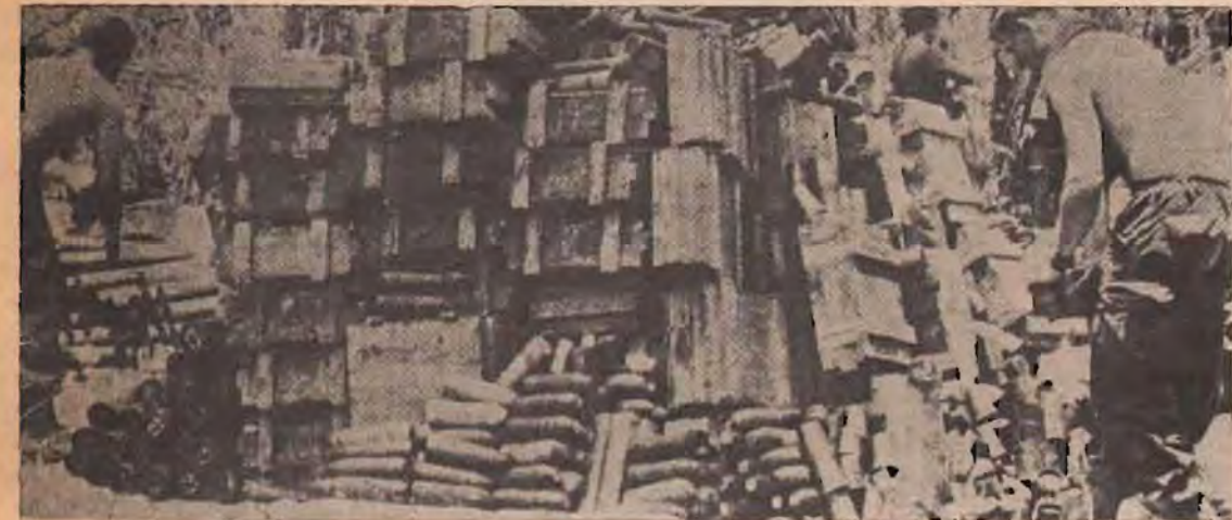
There is no truth to the rumor that the Student Senate is stock piling munitions in preparation for the spring offensive against the Administration.