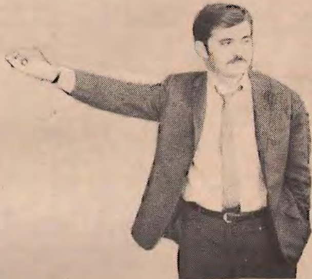
What's a Grecian Urn . . . oh, about $15 a week.