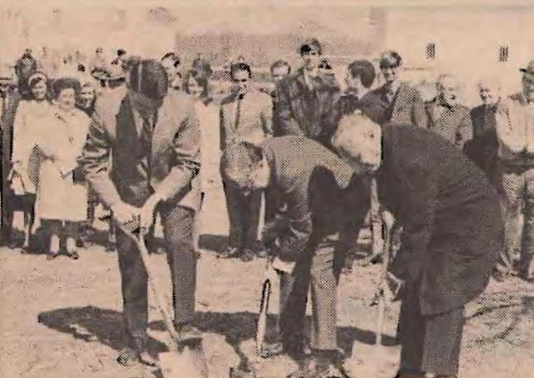
The ad-hoc construction committee workers began work on the new Bryant campus last spring. At eight dollars an hour, who says it doesn't pay to moonlight.