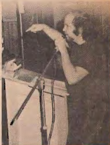
And now for my famed impersonation of the kamikaze swan.