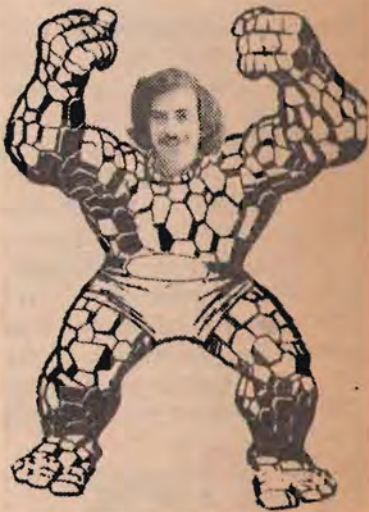
I AM the President! I am the PRESIDENT I am THE president I AM THE PRESIDENT

Karen waited, watching attentively. "I know! I know!" she shouted, jumping and kicking excitedly. "He stinks!" "Very good, Karen. That is the odor of burning flesh, very unpleasant to the olfactory sense. Well, that's about all for today, I'm afraid. He's twitching. We'll be back to tell you about next week's show, after this word from our sponsor." After the commercial, Jimmy and Karen were sitting on a couch, holding hands. "Well, that's all for now, kids. Karen and I will be back next Saturday morning, when we'll ask about 'Sexual Stimulation and the Erogenous Zones.'" "Christ on a pogo stick, Jimmy Wizard, that sounds like a fun show!" "It will be, Karen," said Jimmy, pinching her playfully, as if to preview briefly the next week's show. "Be sure to tune in next Saturday for 'The James and Karen Wizard Show.'"