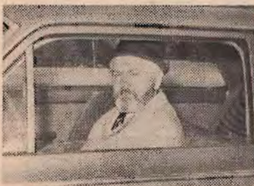
Would you buy a used car from this man ? ? ?