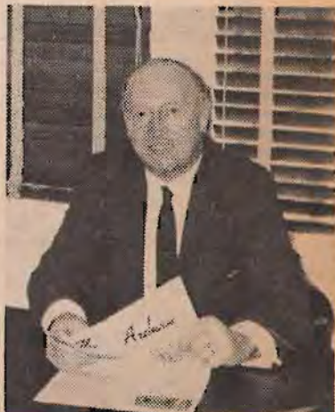
At least one administrator has good taste in his choice of literature.

Well, how do you like the teachers here? Is that a true-false question or a multiple choice? The teacher is a very important part of the classroom. Remember — it's what up front that counts!