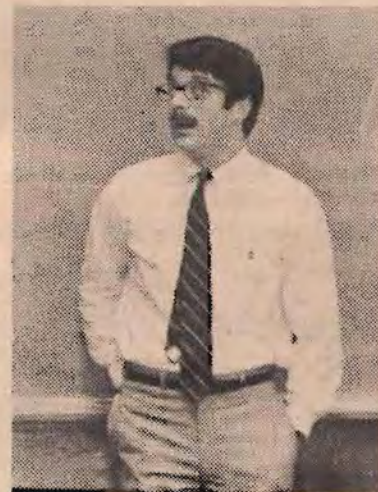
A h . . . Mary had a little lamb . . . whose revolutionary disciplines could only lead to a future conflict of socio-economic, cultural, and pseudo-intellectual homosapienistic tendencies.

Last week I saw one of the teachers that I had for Law going down route 95. He was in a suit of armor on a white horse, a mare of East Providence, with a spear in one hand and a can of Ajax in the other. The reason why the teacher was on a horse, was that one of his students, who was issued