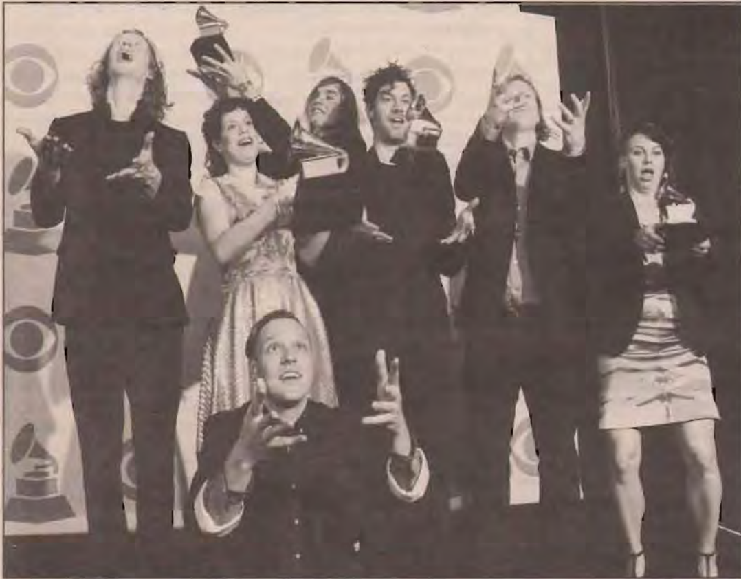
The Arcade Fire at the Grammys