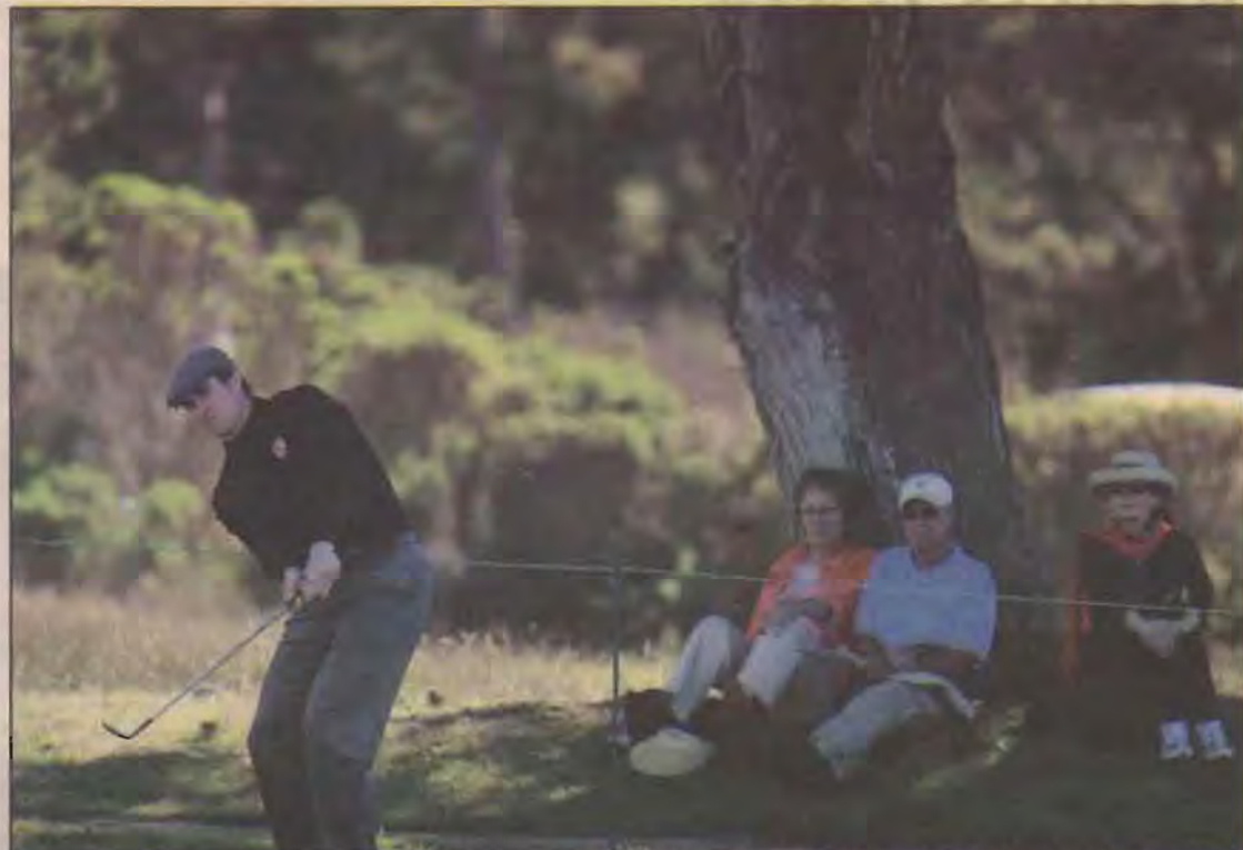
Drew Brees has always had a good golf game, but with the labor stoppage it appears he'll have plenty of time to get even better.

Meanwhile, many assistant coaches, scouts, and front office personnel receive their salaries evenly over the