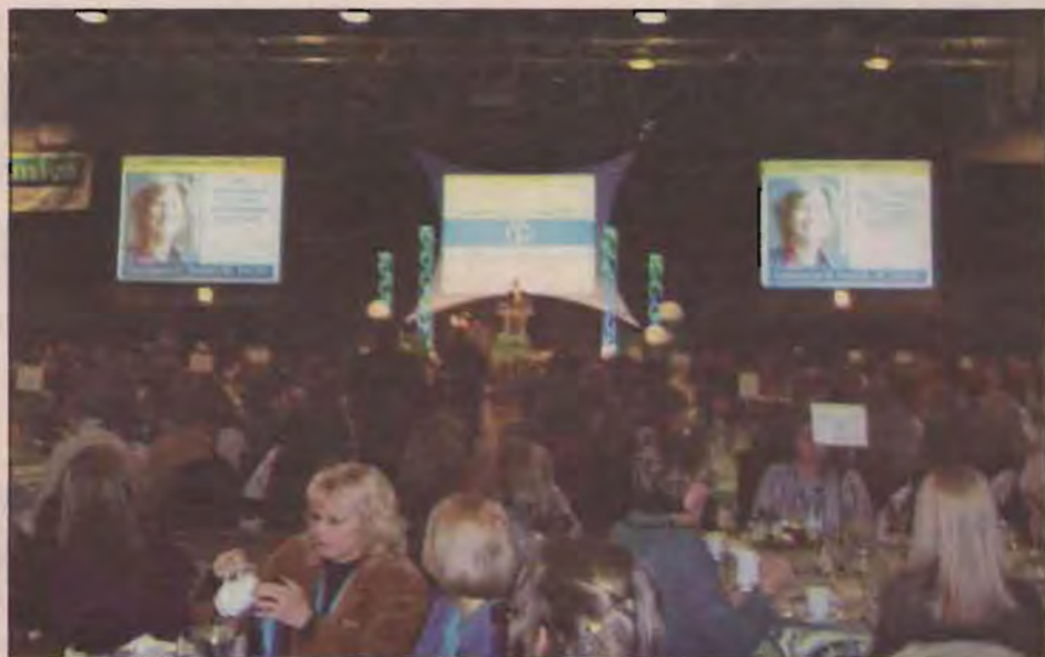
1000 women of all ages and occupations came together to listen to one another's stories and tribulations about strength and success in the workforce and at home. The main gym was transformed into the gathering place for lunch and 3 keynote addresses throughout the day.