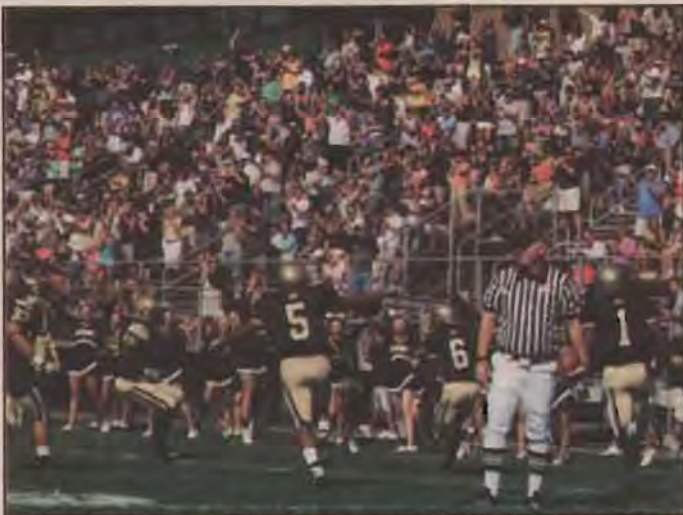
Bulldog nation awaits the Spring premiere of the Black and Gold.

The 2011 season kicks off September 3 when the Bulldogs travel to Orono, Maine for the program's first-ever matchup against the University of Maine. The 2011 schedule