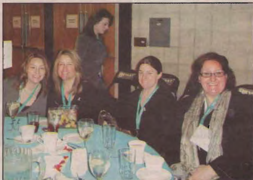
Women were enjoying their lunches in the main gym while talking to one another and enjoying the day's festivities. Even though the rain tried to dampen everyone's spirits, the sessions and events went on without a hitch and the event was an overall success.