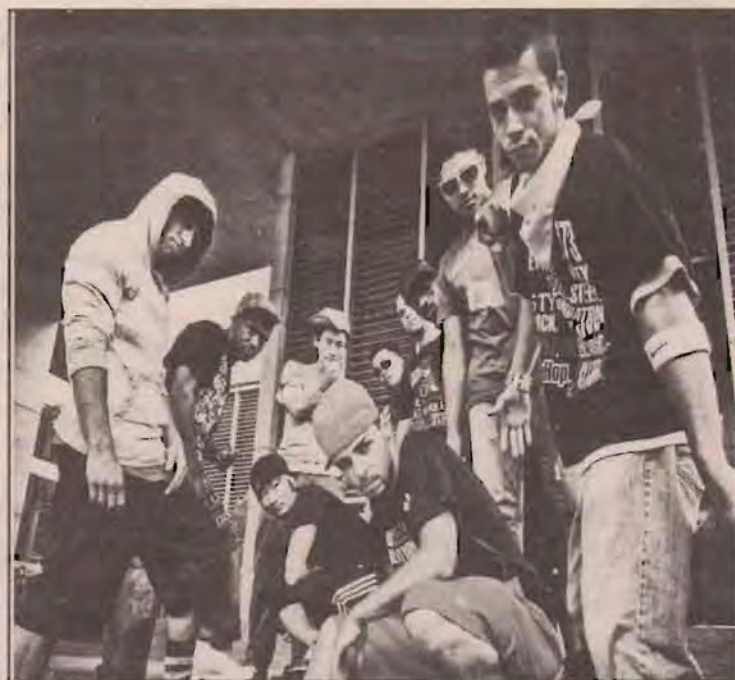
61Syx Teknique

On Thursday, March 24, the Student Arts and Speaker Series will host 61Syx Teknique, a high energy dance group. 61Syx boasts an impressive resume performing for such shows as Fantasia, The Clipse, Talib Kweli, B2K, Lloyd Banks and Fat Joe. Additionally, they have participated in many community and religious performances. For the Bryant event, they will be performing from 5:30 pm - 6:15 pm in Janikies auditorium. During the day, at