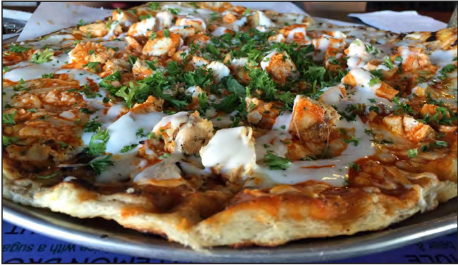
Buffalo chicken pizza

Overall, Bob and Timmy’s is a great place to go off campus for pizza. Their North Smithfield location may seem out of place and unfitting, but once your pizza arrives at the table you won’t think twice about returning. I hope they work on their service, there is no reason for a long wait in an empty restaurant or at least acknowledge it and apologize. Don’t be overwhelmed with their vast menu, stick to your gut and order the grilled pizza. I would suggest going with a group of friends so you can order a variety.