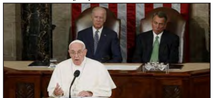
Pope Francis addressing Congress

This Rule points us in a clear direction. Let us treat others with the same passion and compassion with which we want to be treated. Let us seek for others the same possibilities which we seek for ourselves. Let us help others to grow, as we would like to be helped ourselves."