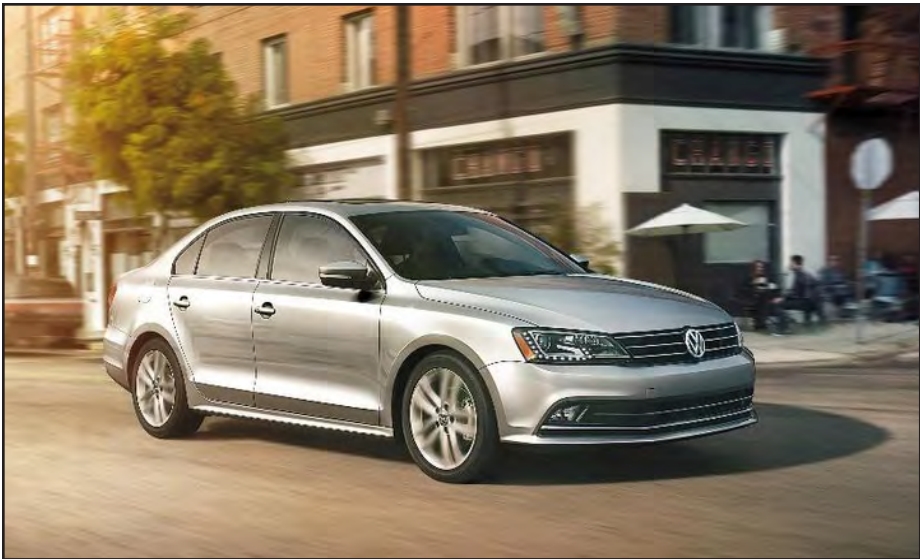
Figure SEQ Figure \ * ARABIC 1: Volkswagen Jetta (one of the recalled cars)