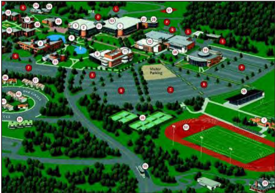
Campus map highlights available parking (Bryant University)