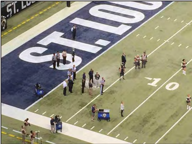
Cleanup crews worked hard to make the field safe for players before the game could start

While no players were hurt, they were instructed to return to the locker rooms before re-entering the field later to allow for proper cleanup procedures. The cleanup crew was also hesitant to let the players back out due to the gas that the fire