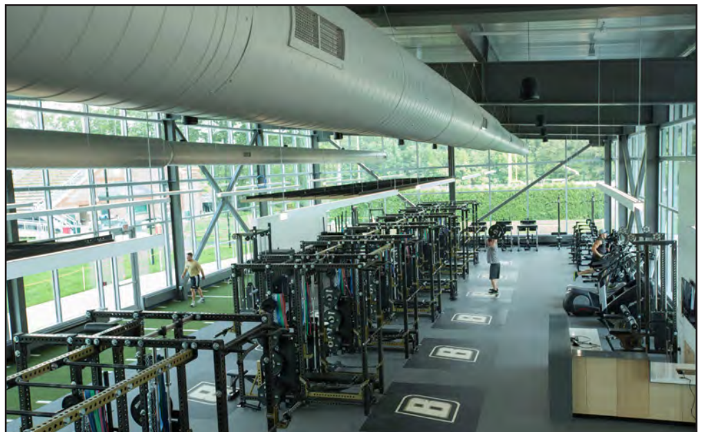
Inside the Bulldog Strength and Conditioning Center.

This facility will enable athletes to train more efficiently and effectively with new equipment specially designed to reduce the amount of weight related injuries. The new facility nearly triples the size of the previous varsity weight room and is now large enough for entire teams to work out together in one rotation. Along with the weightlifting stations and platforms, the building includes an indoor turf sprinting area and nutrition station. With help from strength and conditioning, head coach, Craig Buckley,