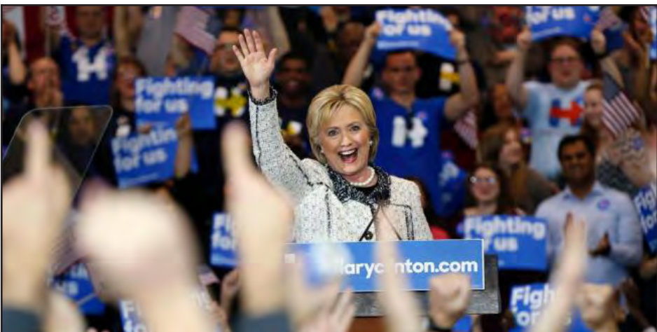
Hillary Clinton wins big in South Carolina on February 27.