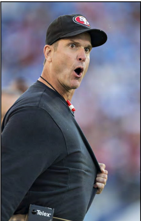
Jim Harbaugh's firey personality has already shown during the first week of Michigan practices

The benefits for practicing in sunny Florida are pretty obvious. It's warm. It's outdoors. It's a happy escape from a northern winter's last cold breaths. That was enough for Jim Harbaugh, who brought his football team into the Southeastern Conference's talent-rich backyard for the first week of Michigan's spring football practice. But Harbaugh couldn't escape the third degree following