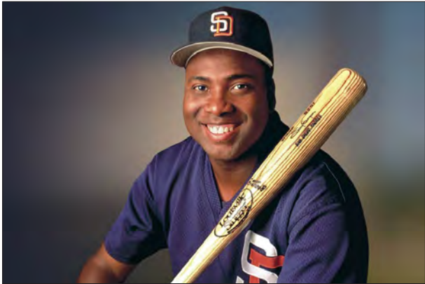
Tony Gwynn coached for nine years before passing away from cancer

After having been out in San Diego for four days, I can say it has been a humbling, early test of our team, but once again the opportunity is what is truly important. The chance to play in a tournament that remembers a legend in the game of baseball is a foundational