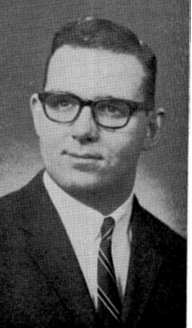
Gordon Russel Plants