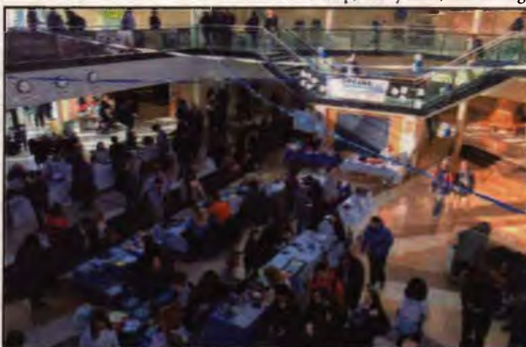
Students browse the marketplace in the Koffler Rotunda