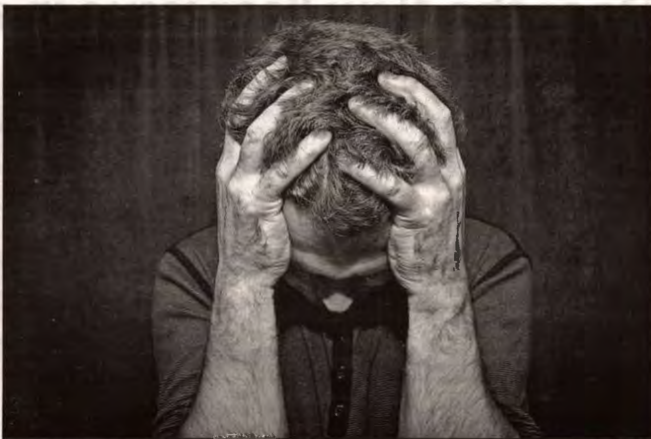
(Meant to be Happy)

It is especially common for college students to feel depressed and feel hopeless. Luckily, Bryant has a great counseling service in the unistructure. I know at least 10 of my friends who go to counseling whether it's to talk about something serious or just because they want to talk to someone and express their thoughts. I grew an interest in finding out how many college kids actually know warning signs. Therefore, a few weeks ago I approached a few of my close friends and asked them if they would be able to notice someone suicidal. Overall, 2:5 of my friends knew few tactics that they thought would be a red flag.