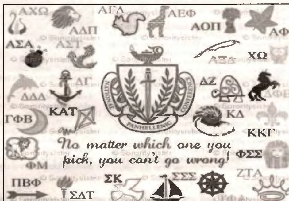
Try new things to find something you truly love (SororityGirlThoughts)

If Greek life sounds like something you can see yourself a part of, sign up today through this link: enroll.icsrecruiter.com/pan/BRYTUN