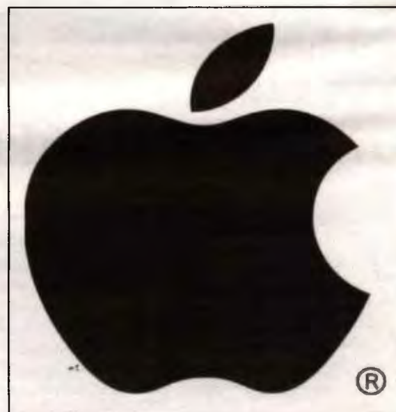
Apple Logo (apple.com)

Apple recently released their iPhone X as well as the iPhone 8. There were worries that the new screen would push customers away as well as a hefty price tag that could scare off buyers especially with the release of the Pixel 2 which has a higher DX score boasting a superior camera at a lower price. Nonetheless sales of the iPhone X have been very strong signaling new price patterns for smartphones and premium models. The company may be looking for other big changes especially following new design employees, a revamped MacBook Pro, new screens powered by OLED, and a new announcement following the Mac Mini. Apple has not updated their Mac Mini in years since 2011 and will no longer be servicing them. Marketing chief Phil Schiller mentioned that it is an "important product," but no specific plans that they will be introducing a newer edition. Additionally, Apple may be venturing into vertical integration and developing its own PMIC or power-management integrated chips. Dialog Semiconductor's CEO Bagherli said, "Apple has the resources and capability to internally design a PMIC and could potentially do so in the next few years." Dialog's CEO mentioned that there were no risks to their existing contracts for 2018 and were in advanced talks for 2019. Apple has become a strong leader in other areas as well with Tim Cook, Apple's CEO, visiting China for a conference as well as Nadella of Microsoft. The topics of interest