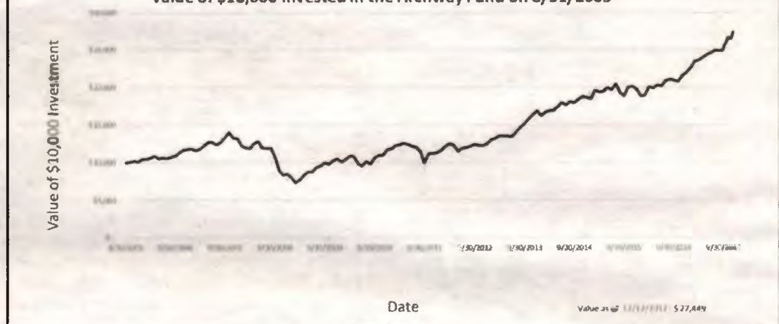
Value of $10,000 Invested in the Archway Fund on 8/31/2005