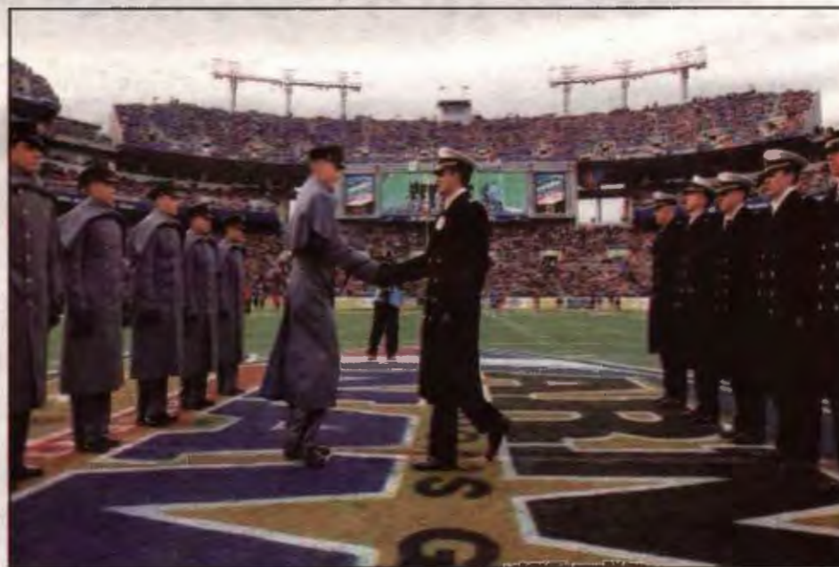
The Army/Navy game has become a well respected tradition every year

I personally found 14-13 to be surprising, and thought that Army would have scored much higher. I base this rationale behind the fact that first Navy beat Air Force in a very close game of 48-45. Second, Army crushed Air Force 21-0. Air Force has not been shut out at their home field since 1980 when they played Boston College. Thus, it would have seemed apparent that Army would have blown Navy out of the water.