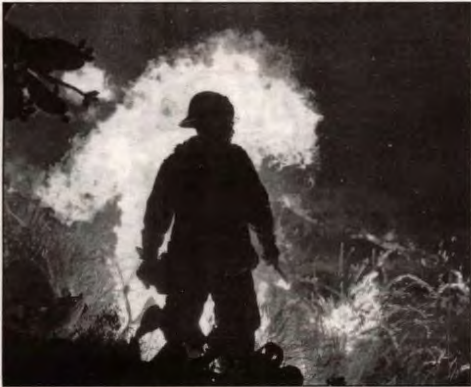
A firefighter looks upon a wildfire blazing in Santa Ana, California

Extremely large wildfires have broken out for the second time in the last two months in California. In mid-October wildfires destroyed thousands of acres of land and homes in the Northern California, Napa area. These fires burned for over seven days and were extremely hard to contain. Now, Southern California has burst into flames around the Los Angeles and San Diego County areas for over 5 days now. According to CNN, there are at least six large wildfires that have scorched up to 141,000 acres of land, where at least 5,700 firefighters are working to contain the fires.