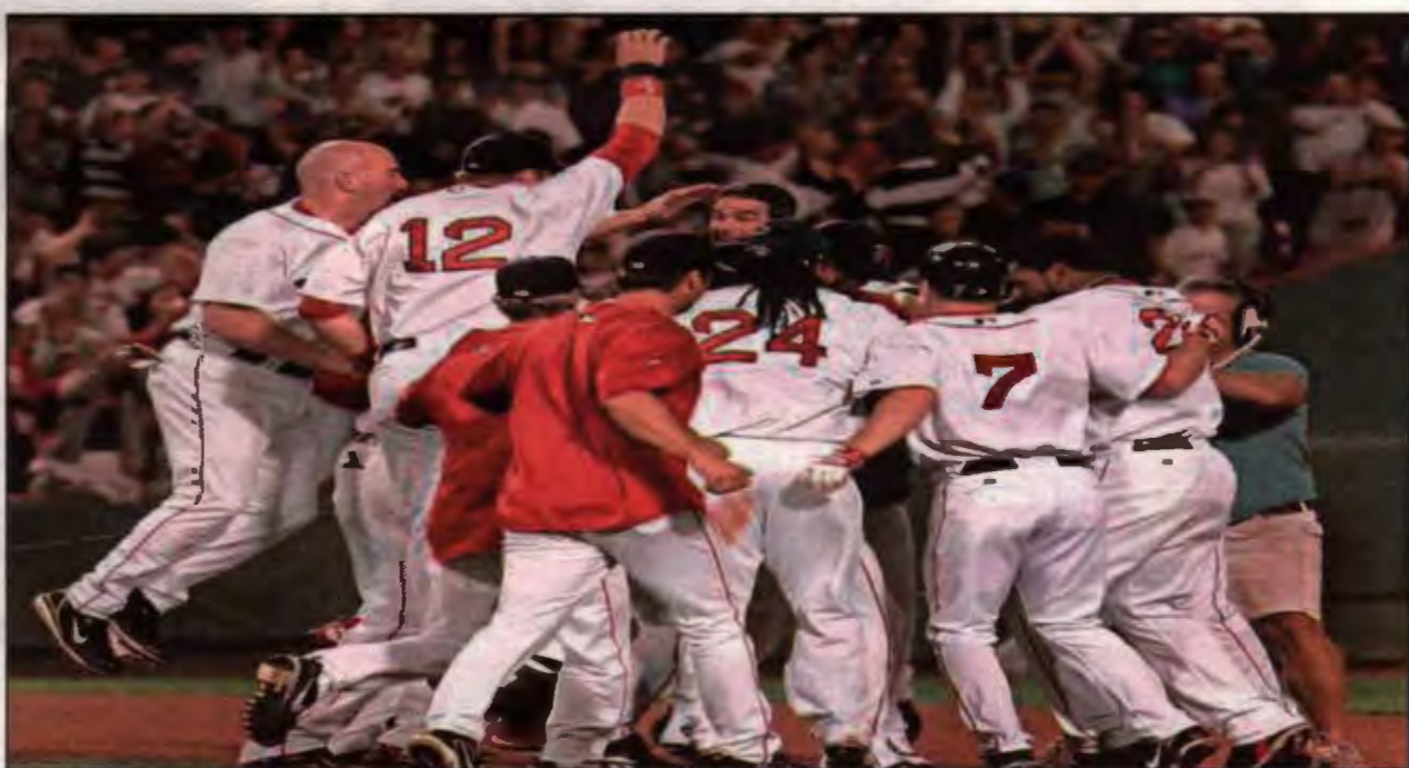
Boston sports fans are accustomed to celebrating like the Red Sox

One of the most iconic Boston sports moments I had the privilege to see, was David Ortiz's pregame speech a few days after the Boston marathon bombing. Watching him speak to a stadium full of a city in mourning, gives me the chills to this day. Both of the Patriots most recent Super Bowl wins, define Boston's resilience and shows their character and how they are prepared for every situation. Malcolm Butler became a household name