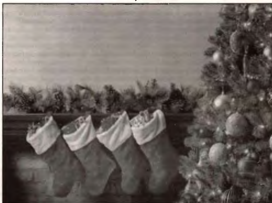
Enjoy the holidays with your family and friends

School is out for a month. So what can you do? Before all else, be thankful that you have a month off. Christmas is less than two weeks away, so if you have not done your shopping, now is the time! Many stores will offer deals on demanding gifts for family and friends, you just have to find the right ones. Get creative this year. But at the end of the day, always remember it is the thought that counts. The true meaning of Christmas is so much more than gift giving. It's a time of Thanksgiving, family, and celebration.