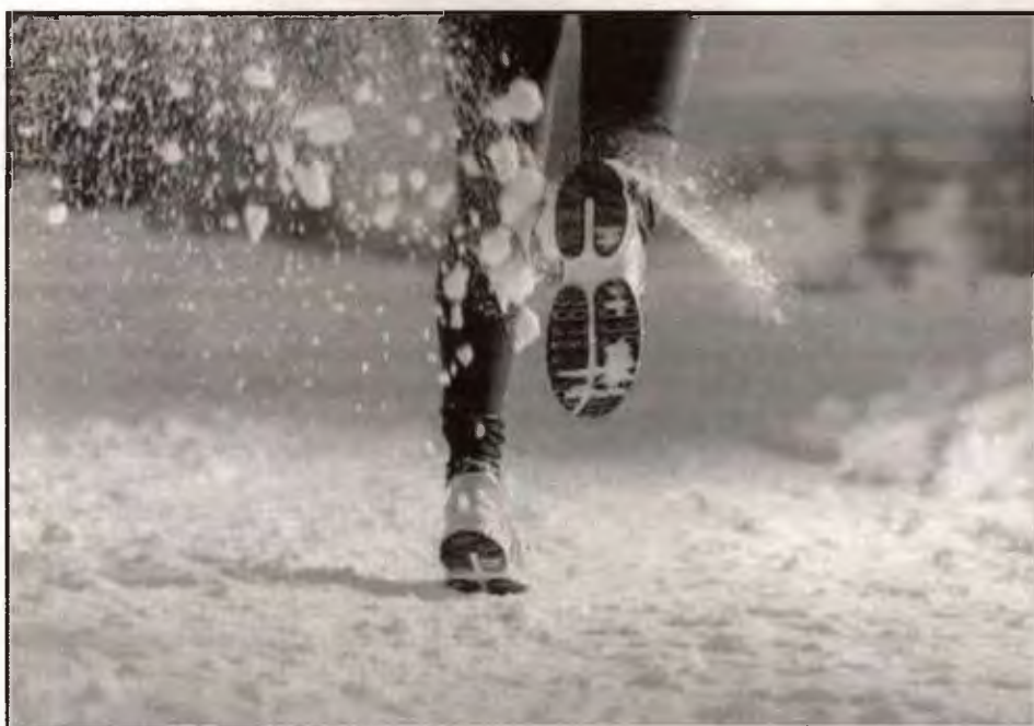
Your success is correlated to proper preparations (TreadmillFactory)

As we transition into the winter season, the holidays are just around the corner, and with them comes a long-awaited winter break. If you have been running all along, now is not the time to stop. The cold weather should not keep you indoors. Rather, you should embrace it and find ways of enjoying it! If you are new to running, this is a great time to start as well. However, because the temperature drastically changes, there are a few proper precautions you must take to ensure your run is safe and still enjoyable.