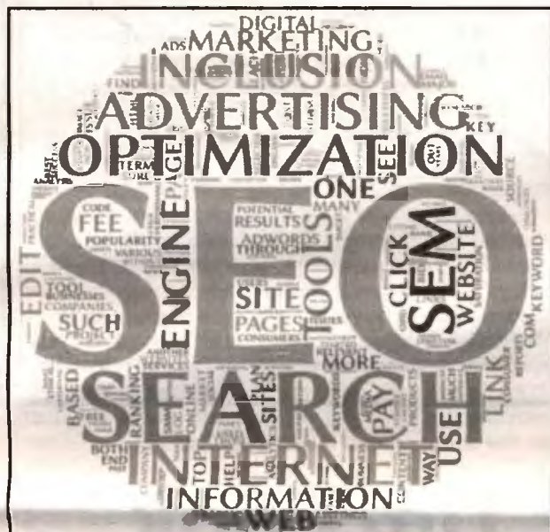
Search engine optimization (joshnasspr.com)