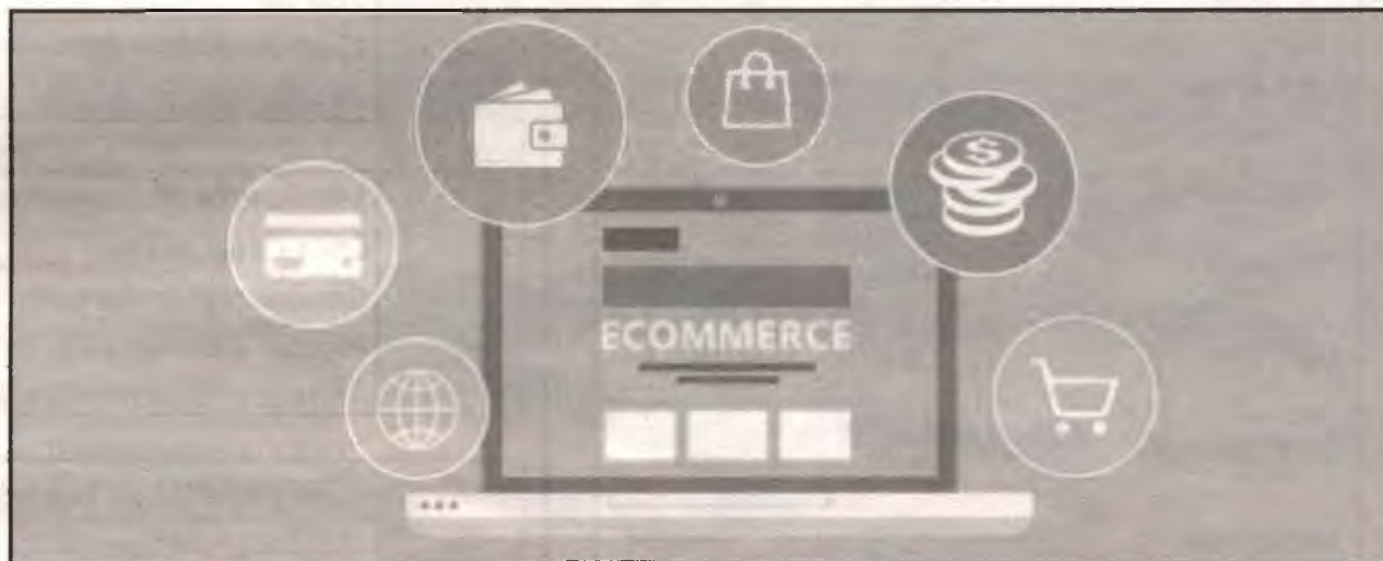
eCommerce business may lead to the end of brick-and-mortar retail

It is an exciting time to be in eCommerce, and not so for brick-and-mortar retailers. Stores with physical locations are down, hurting even the biggest of companies from Nordstrom to Sears with many falling to bankruptcy. Meanwhile companies like Amazon, Wayfair, and Newegg are stronger than ever. Companies like Wayfair have an ingrained strategy to help them maintain a competitive edge, and smaller companies that have been acquired have followed some basic guidelines to build a moat in online businesses. These do not just apply for eCommerce but for online, media, and technology companies such as the Interactive Group that maintains these rules for their portfolio of brands. The basics of eCommerce can be broken down into the 4 S's.