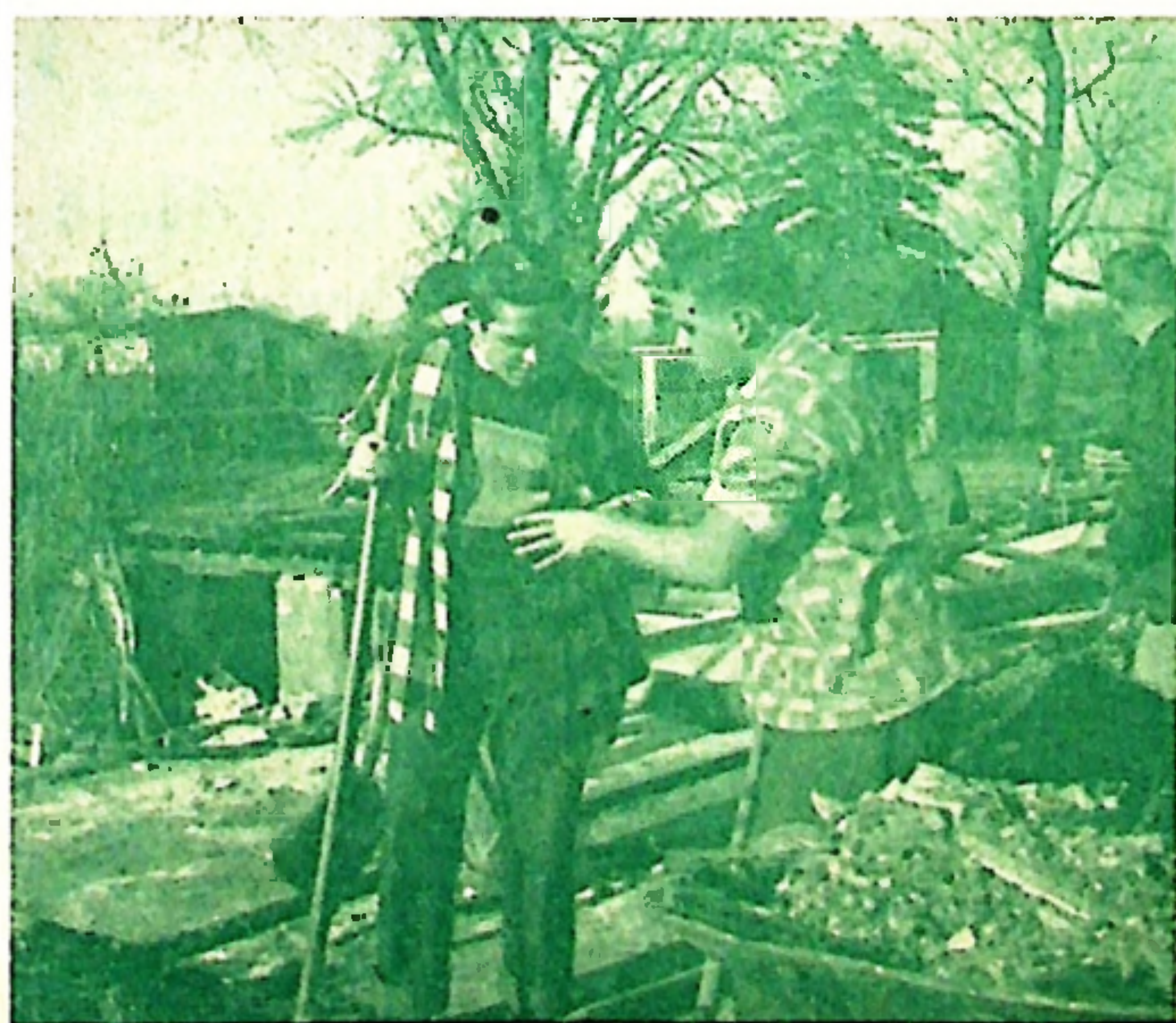
PLEDGE PARTY: Chi Gamma Iota started Hell Week off in a sweaty vein December 7, when pledges turned out at 10 a. m. at R. I. Children's Center on Mt. Pleasant Avenue. The gang cleared rubble that had been left when an old cowbarn was razed.