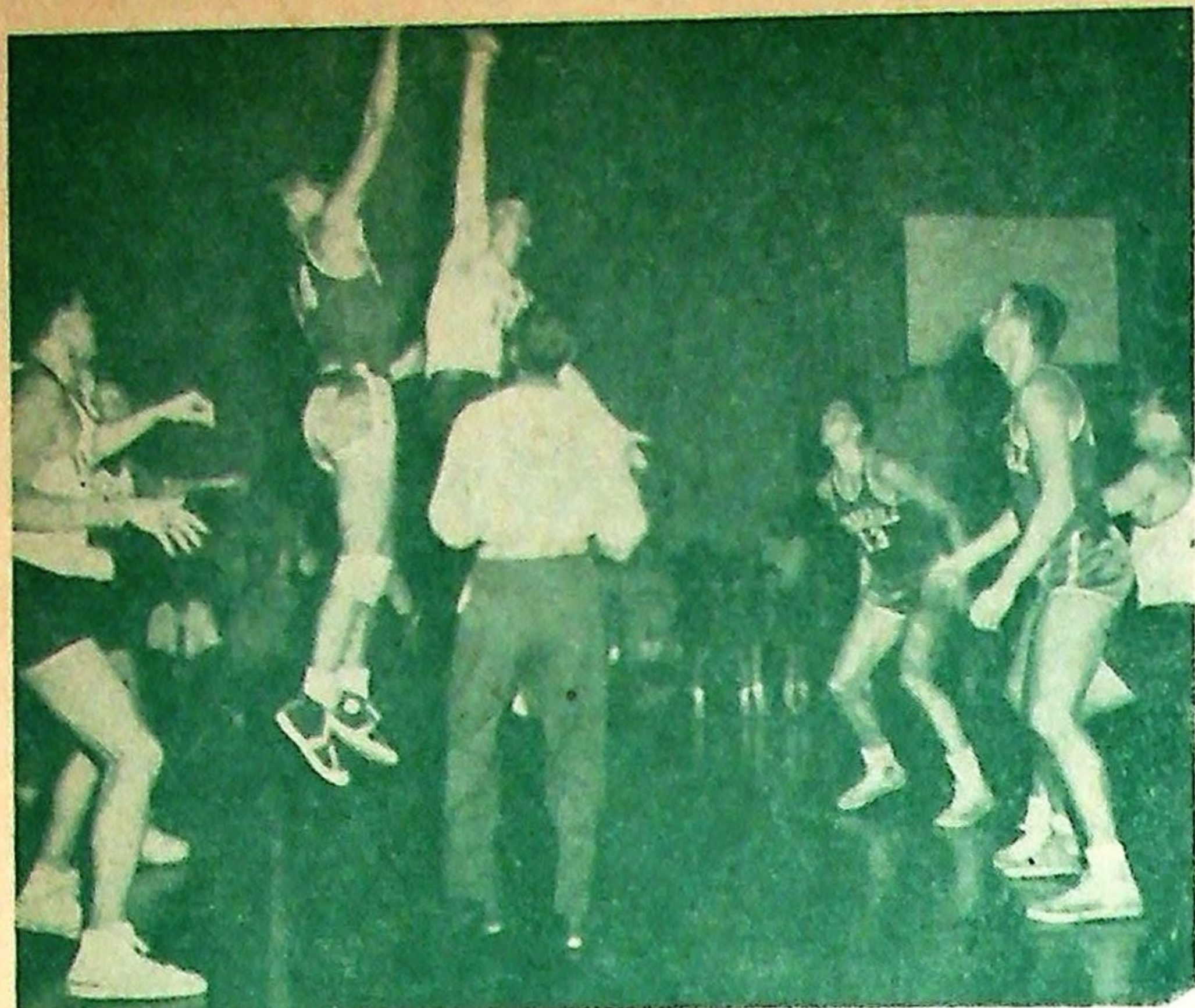
TIP OFF: An action shot of the recent Bryant-Stonehill basketball game in the Hope High auditorium. Bryant was outclassed, but upset the dopesters with a sparkling rally in the final period. Score: Stonehill 64, Bryant 48.